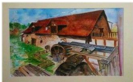
Moulin de Lapeyre

2pm : Walk around the Campsite : 6km in the nature, ending in a beer brewery with a tasting